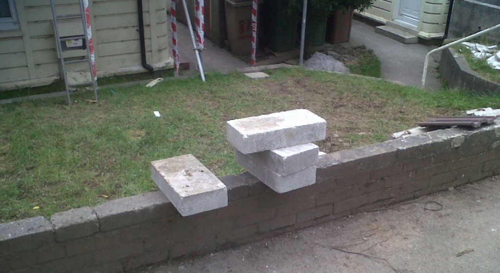
The site staff removed these blocks upon request.