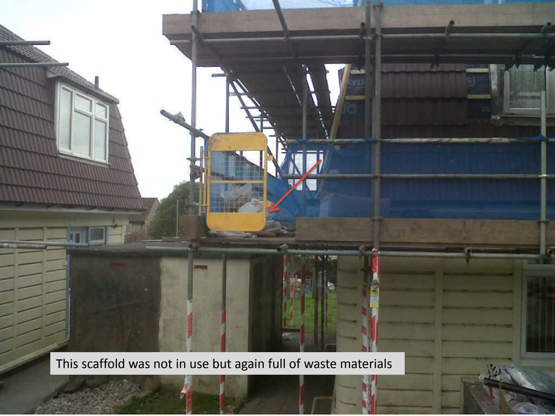
This scaffold was not in use but again full of waste materials